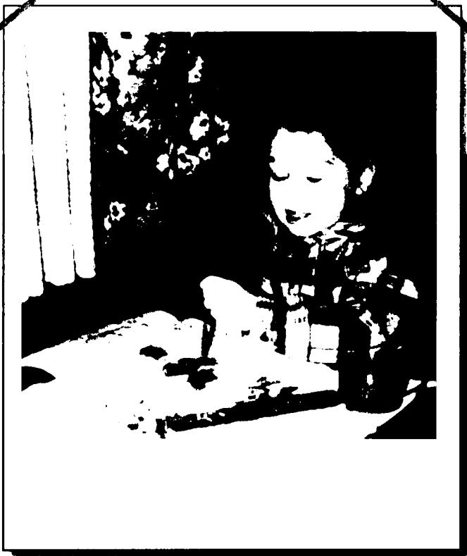
A portrait of the author around 1981 making art at home.

I think I do not remember more about art at school because these experiences were not that important to me. When I look back at the artistic experiences I had as a child, I think mostly about what I made in my home. I spent many afternoons and weekends creating artworks, without instruction and receiving only encouragement and praise from my family. I remember the fun times after school in my bedroom where I played records and made crayon rubbings on the textured linoleum floor. I remember long weekends at the kitchen table painting and making magazine collages to display around the house. I think I remember these activities so vividly because they meant something to me. Now that I teach art to elementary school children, I consider how students perceive art under my instruction. I question what influences their interests, abilities, and values for art. This curiosity led me to explore art activities that students engage in at their homes.