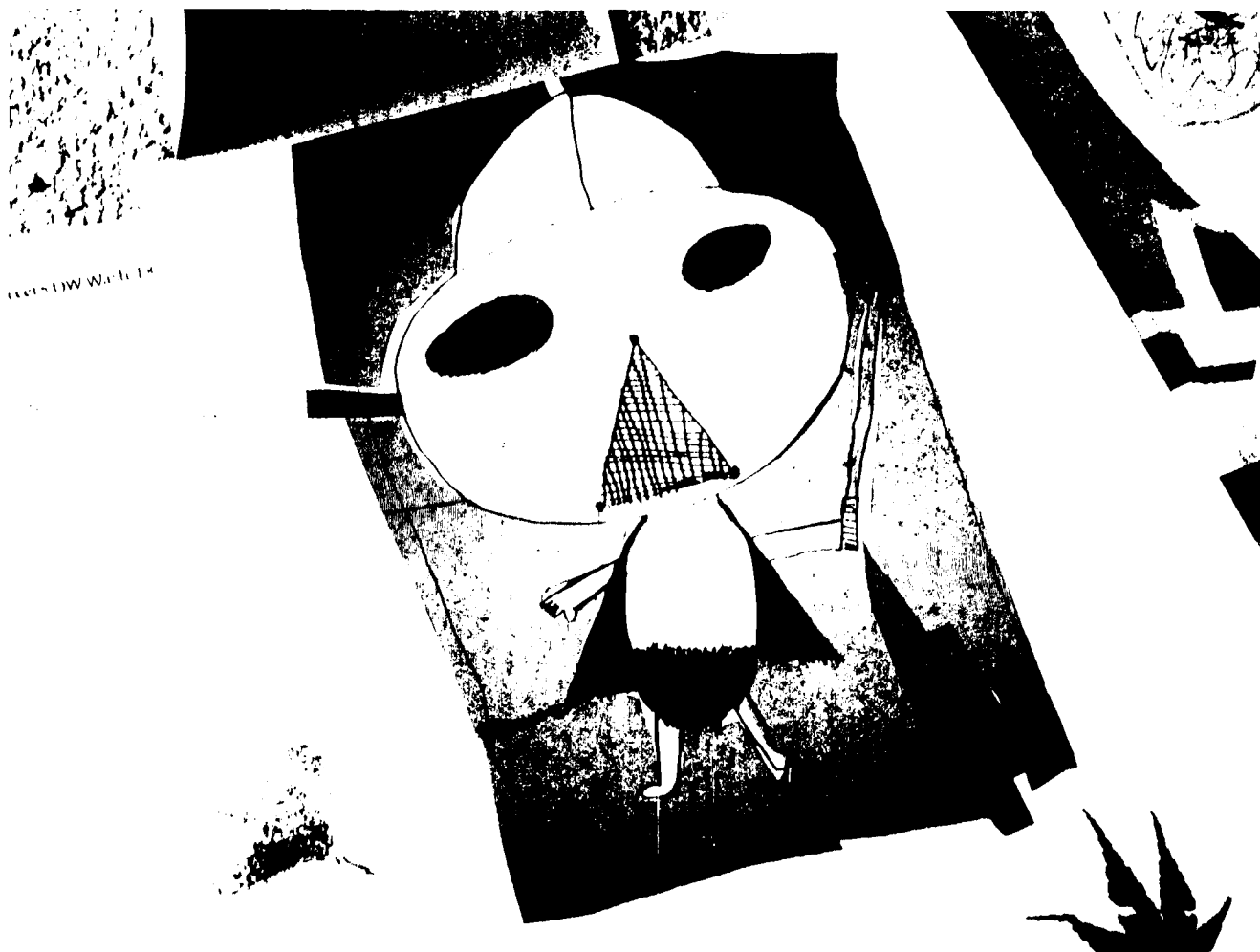
An example of a drawing made at home by the brother in the "Everywhere" family.